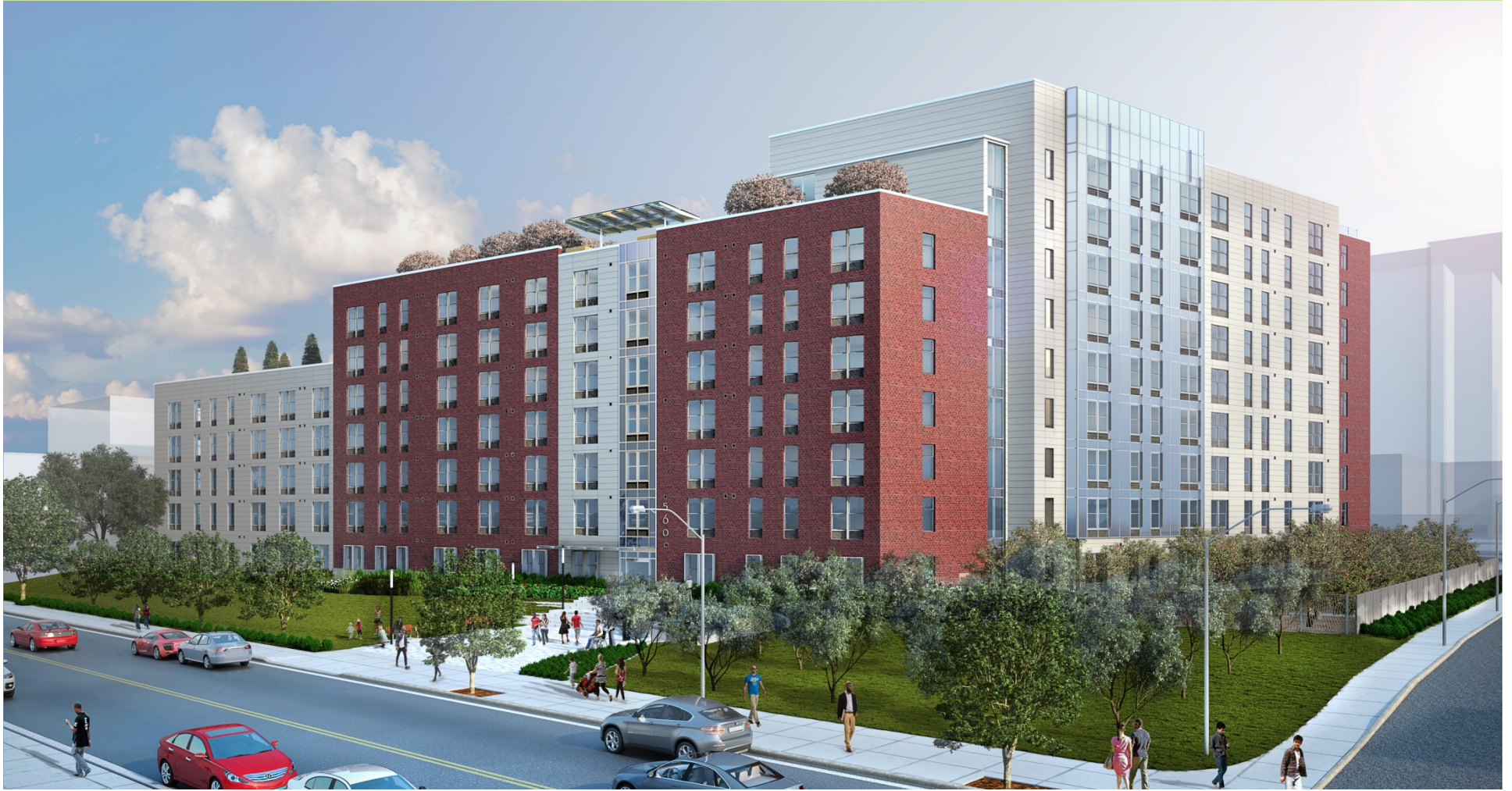
Former Site G, Kings County Hospital Center